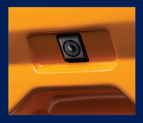
Rear-view camera as standard

Visibility is key while working. That's why the HX65A is equipped with a rear-view camera as standard with the option of a side-view camera.